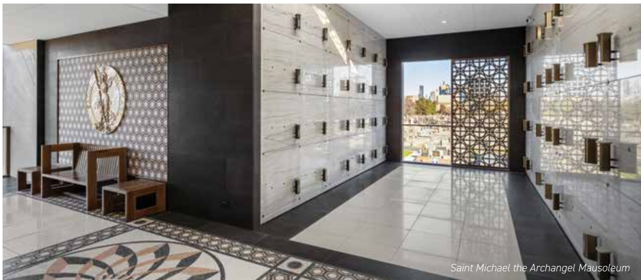
Saint Michael the Archangel Mausoleum

Mausoleum Crypt prices include the reservation/selection fee.