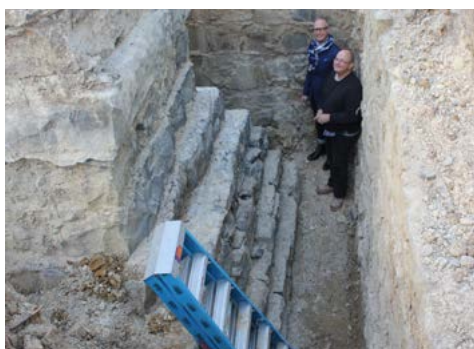
Hotham Monument Restoration