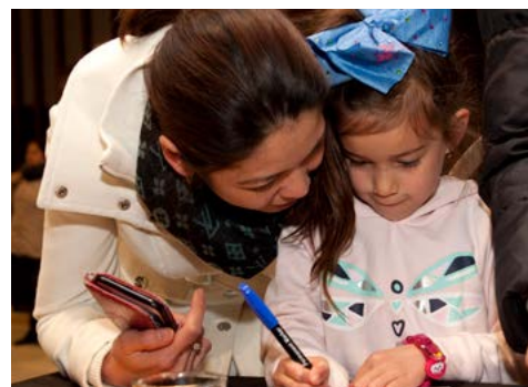
Father's Day Remembrance Service