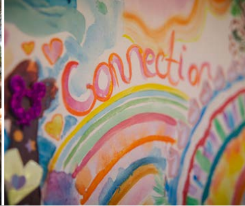
Artwork from a Centre for Care and Wellbeing visitor