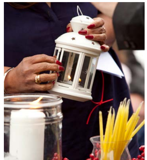
Lighting the Lanterns