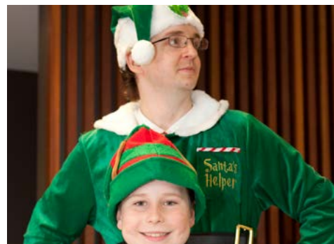
Elf @ SMCT Staff Xmas party 2018