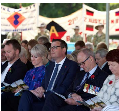
Hon. Daniel Andrews attends RSL Remembrance Day