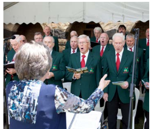
Gallery of images from 100 year Armistice Day Anniversary Remembrance Service held at Springvale Botanical Cemetery, 4th November 2018