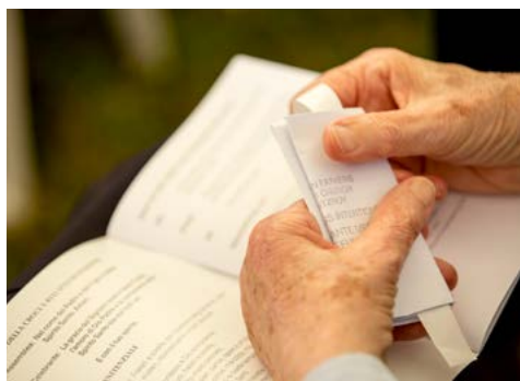
All Souls Day