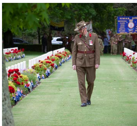
Remembering Fallen Soldiers – Springvale Botanical Cemetery

www.poppyappeal.com.au or www.anzacappeal.com.au