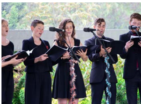
Carols on the Lawn