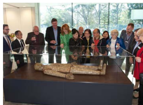
Jade Burial Suit on loan from the Chinese Museum