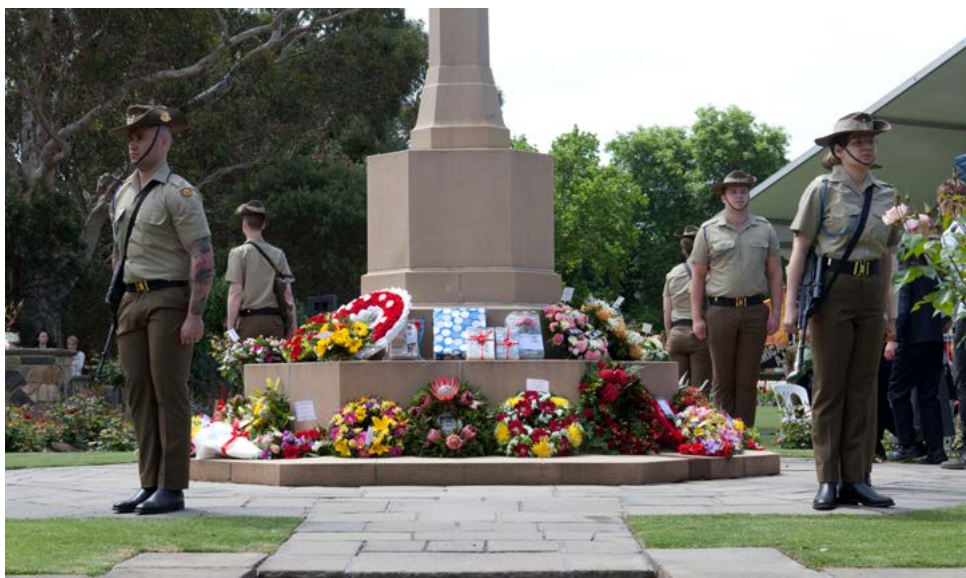
RSL Remembrance Day - Springvale Botanical Cemetery 2018

Then there are the returned service men and women. Who have bravely fought or supported others during war times, who have experienced comradery under extreme circumstances and who went to war