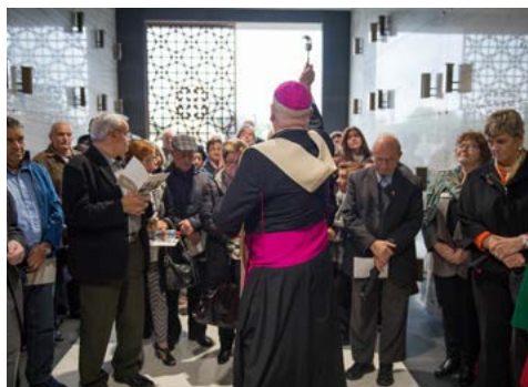
Saint Micheal the Archangel Mausoleum Opening 2018