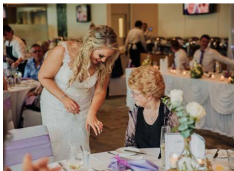
Wedding Reception - Springvale Botanical Cemetery