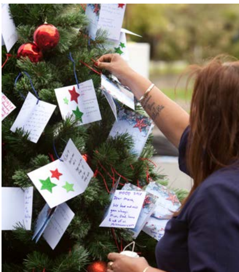
Children's Christmas Remembrance Tree

We thank our families for allowing us to support them again this year.