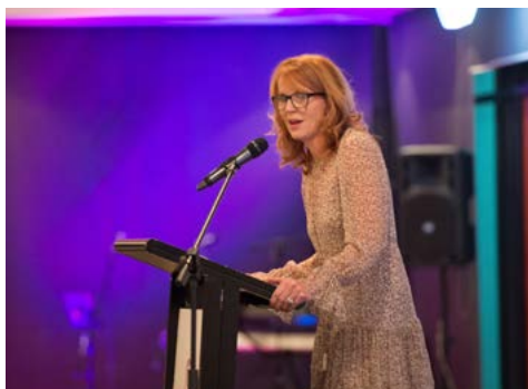
SMCT Annual PRIDE Awards 2018