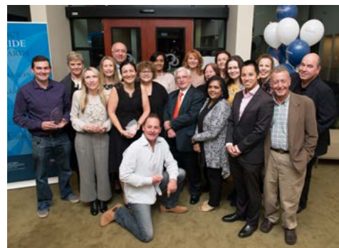
SMCT Annual PRIDE Awards 2018