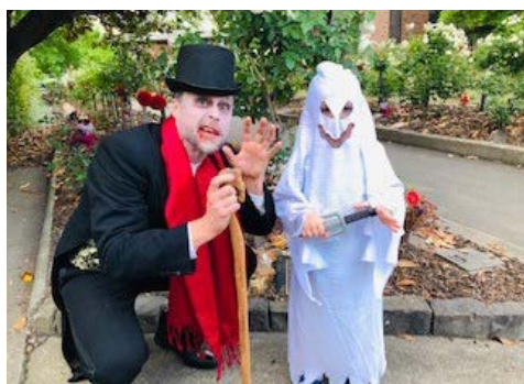
Halloween 2018 @ Melbourne General Cemetery