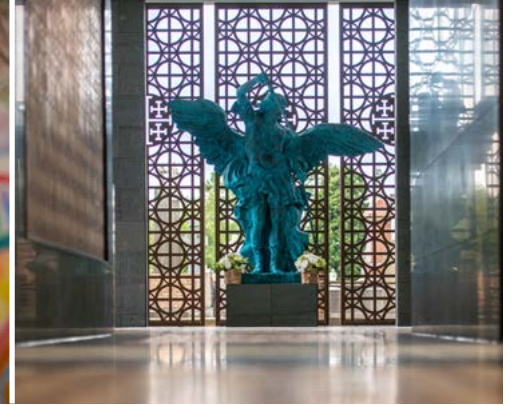
St. Micheal the Archangel Mausoleum – Melbourne General Cemetery