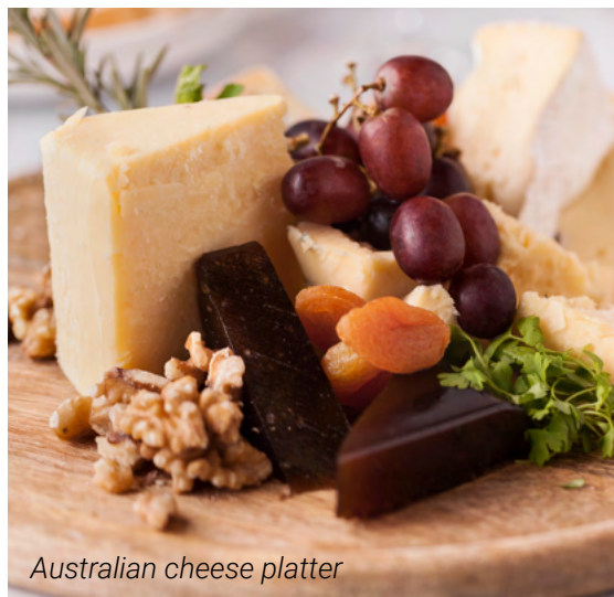
Australian cheese platter

Each platter caters for approximately twenty-five people