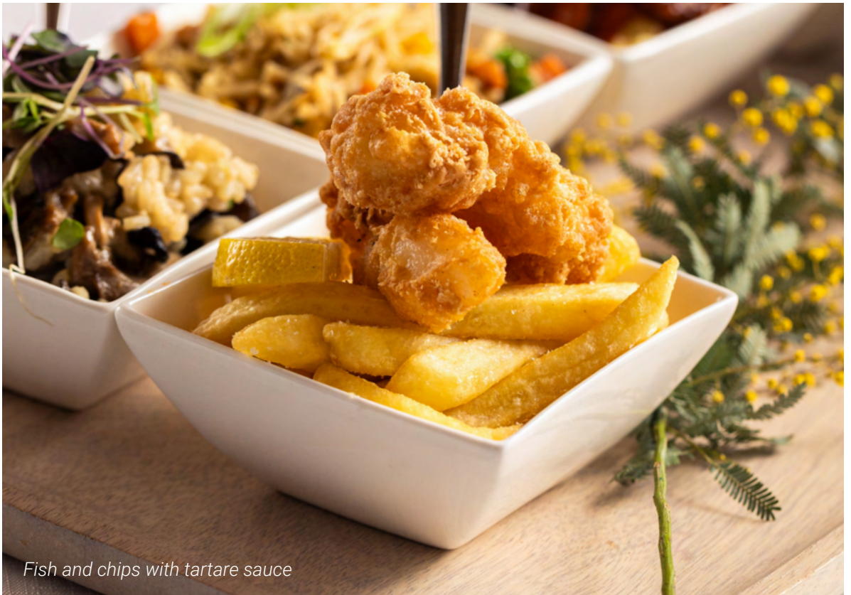
Fish and chips with tartare sauce