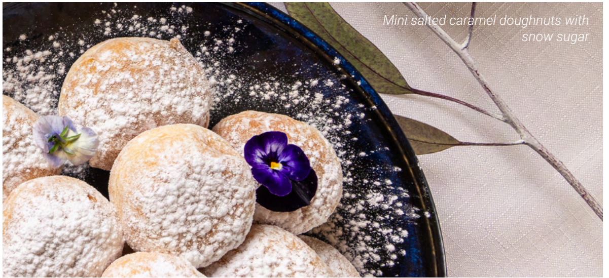
Mini salted caramel doughnuts with snow sugar