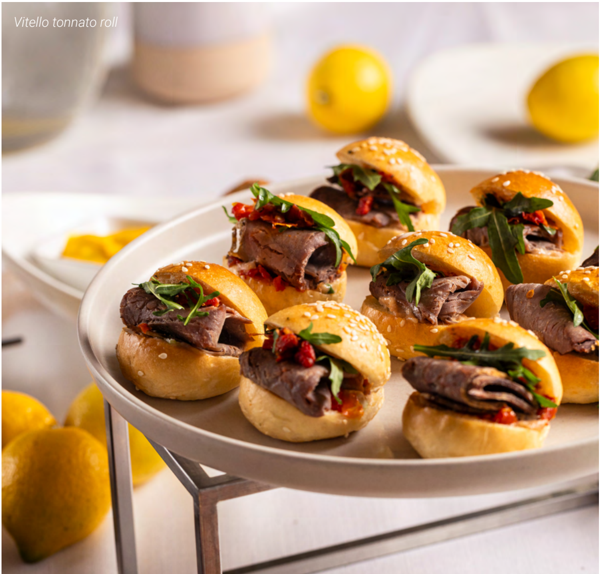
Vitello tonnato roll