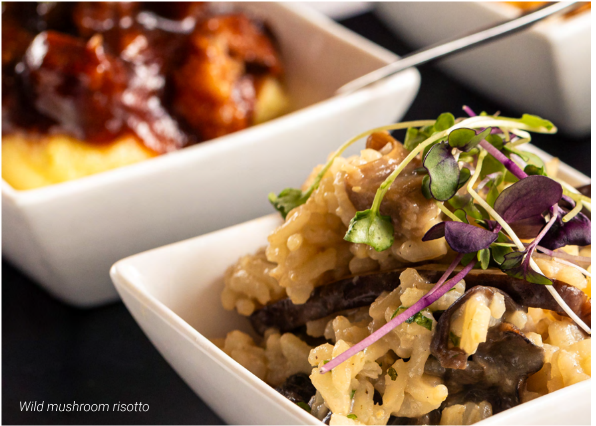
Wild mushroom risotto