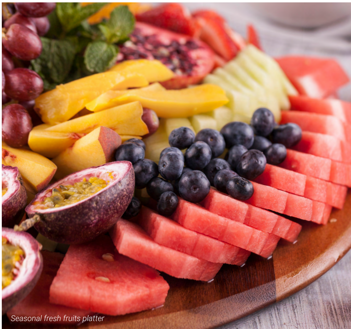
Seasonal fresh fruits platter

* Platters only available in addition to your per person menu selection