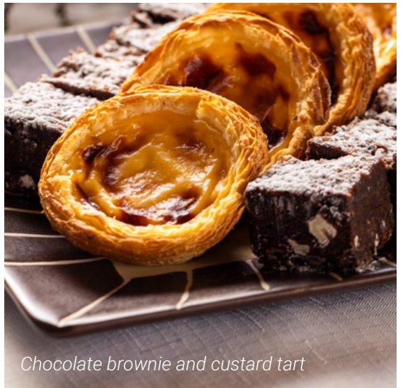
Chocolate brownie and custard tart