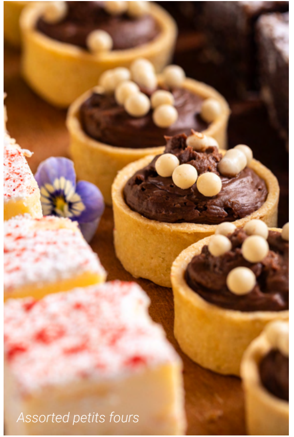
Assorted petits fours