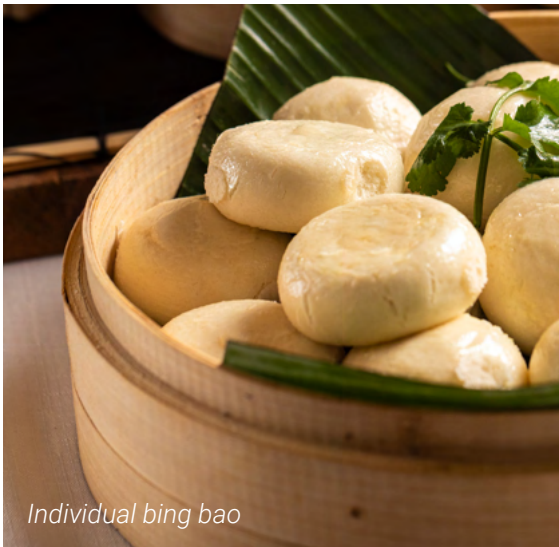
Individual bing bao