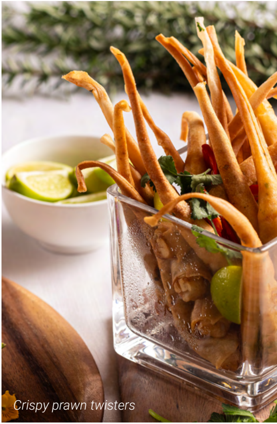
Crispy prawn twisters