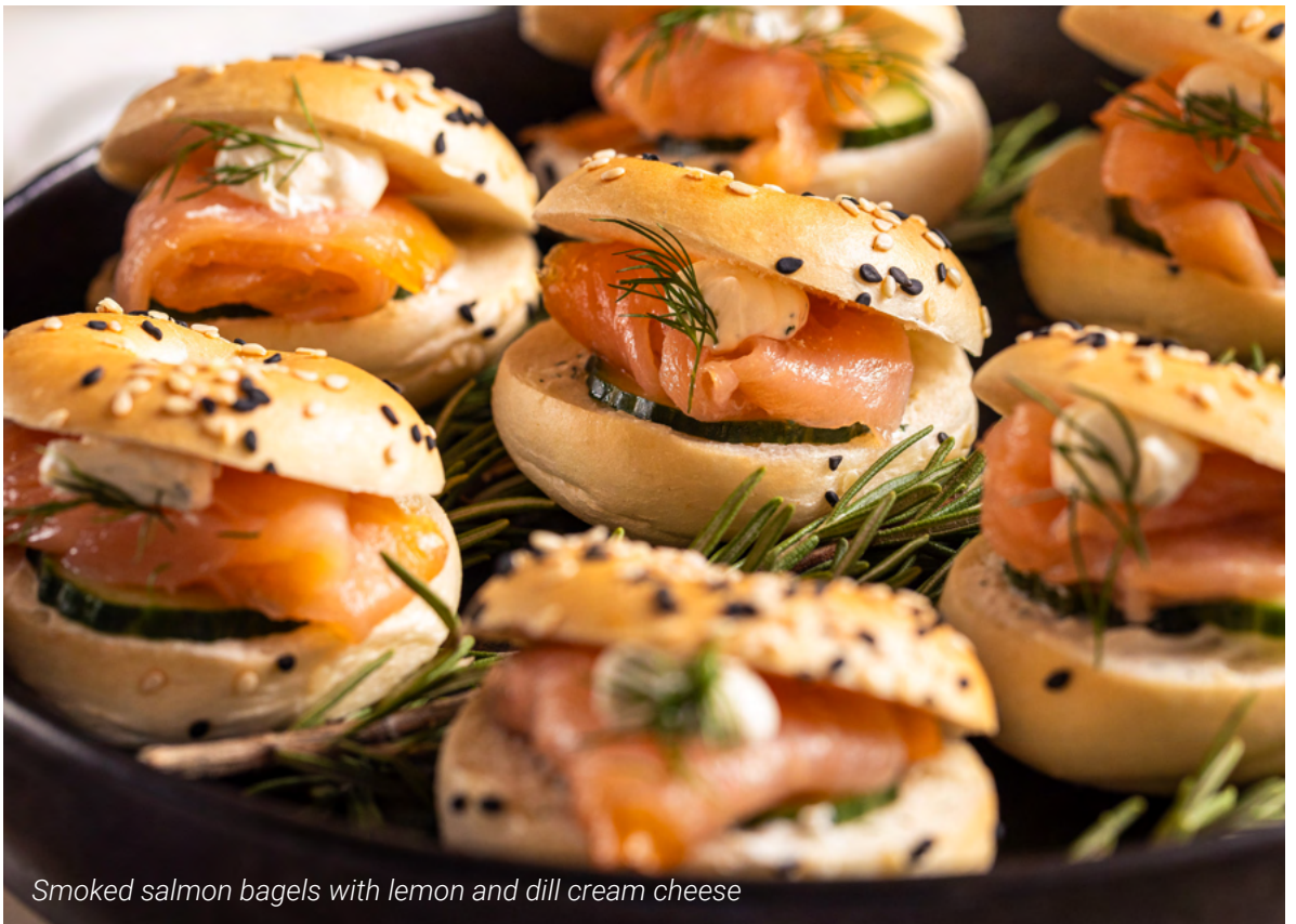
Smoked salmon bagels with lemon and dill cream cheese