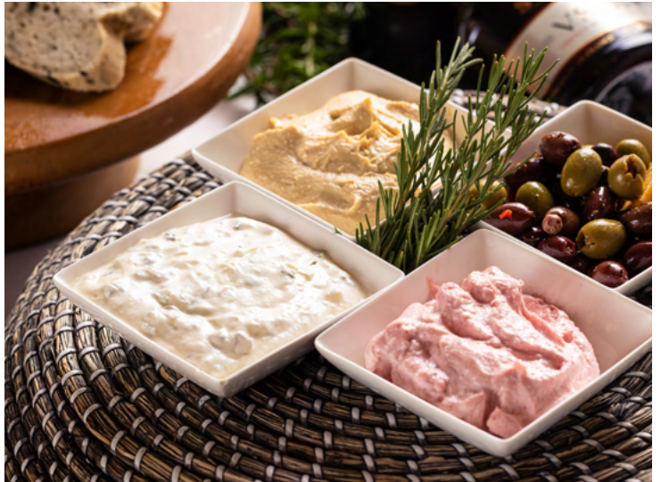
Platter of dips (3 varieties)