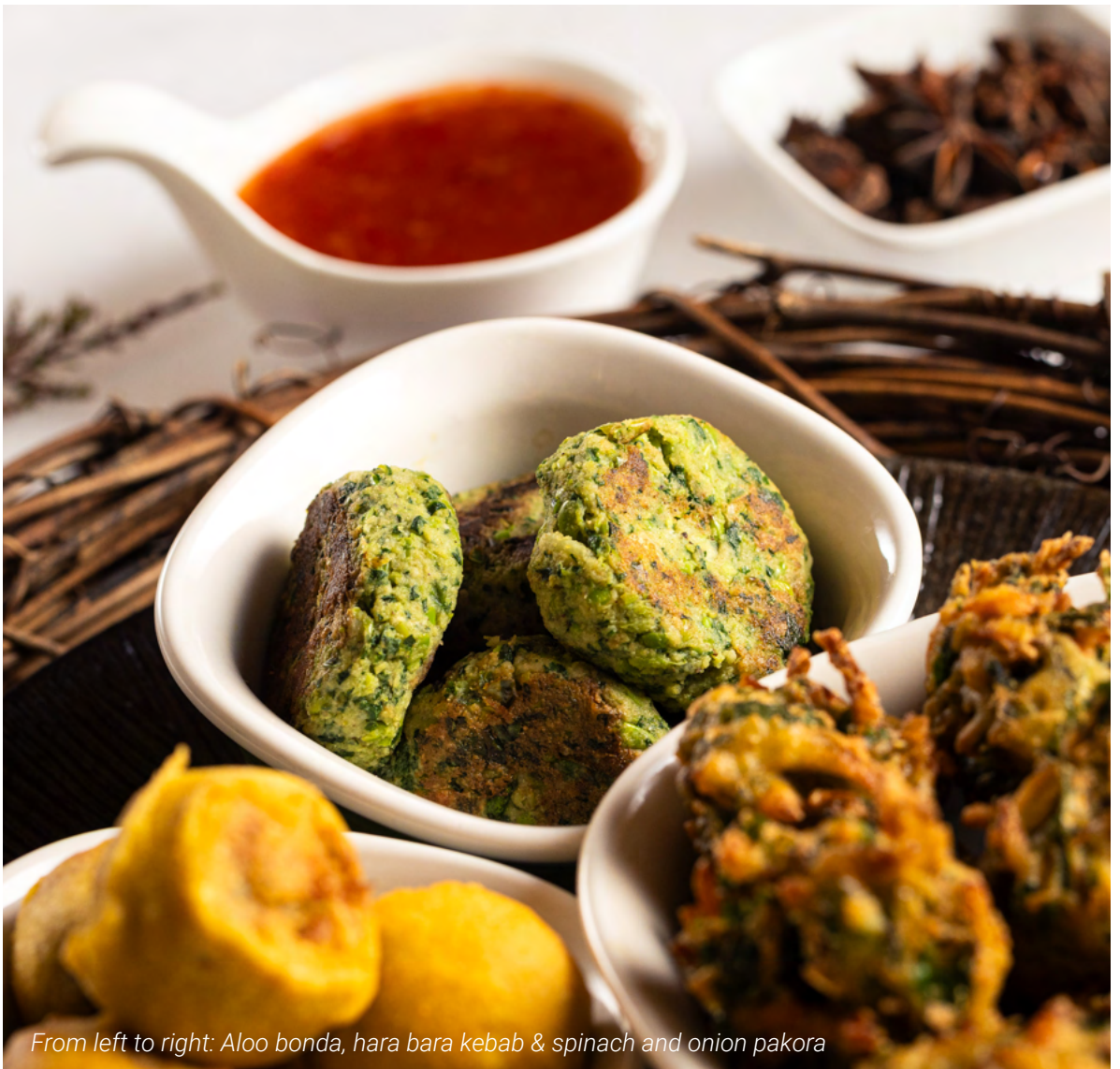
From left to right: Aloo bonda, hara bara kebab & spinach and onion pakora