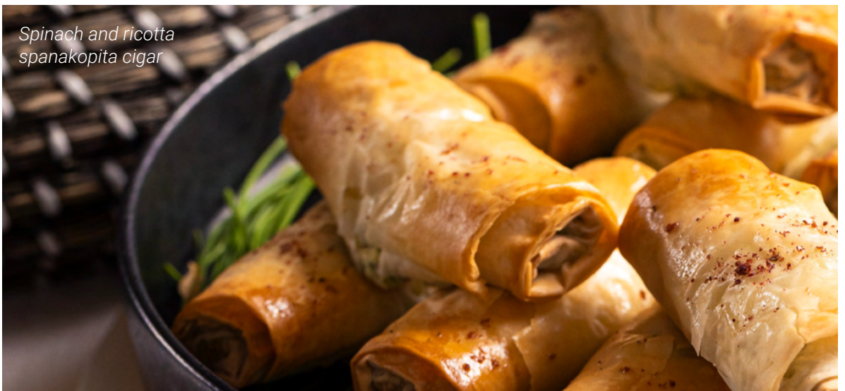
Spinach and ricotta spanakopita cigar