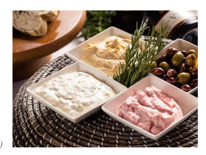
Platter of dips (3 varieties)