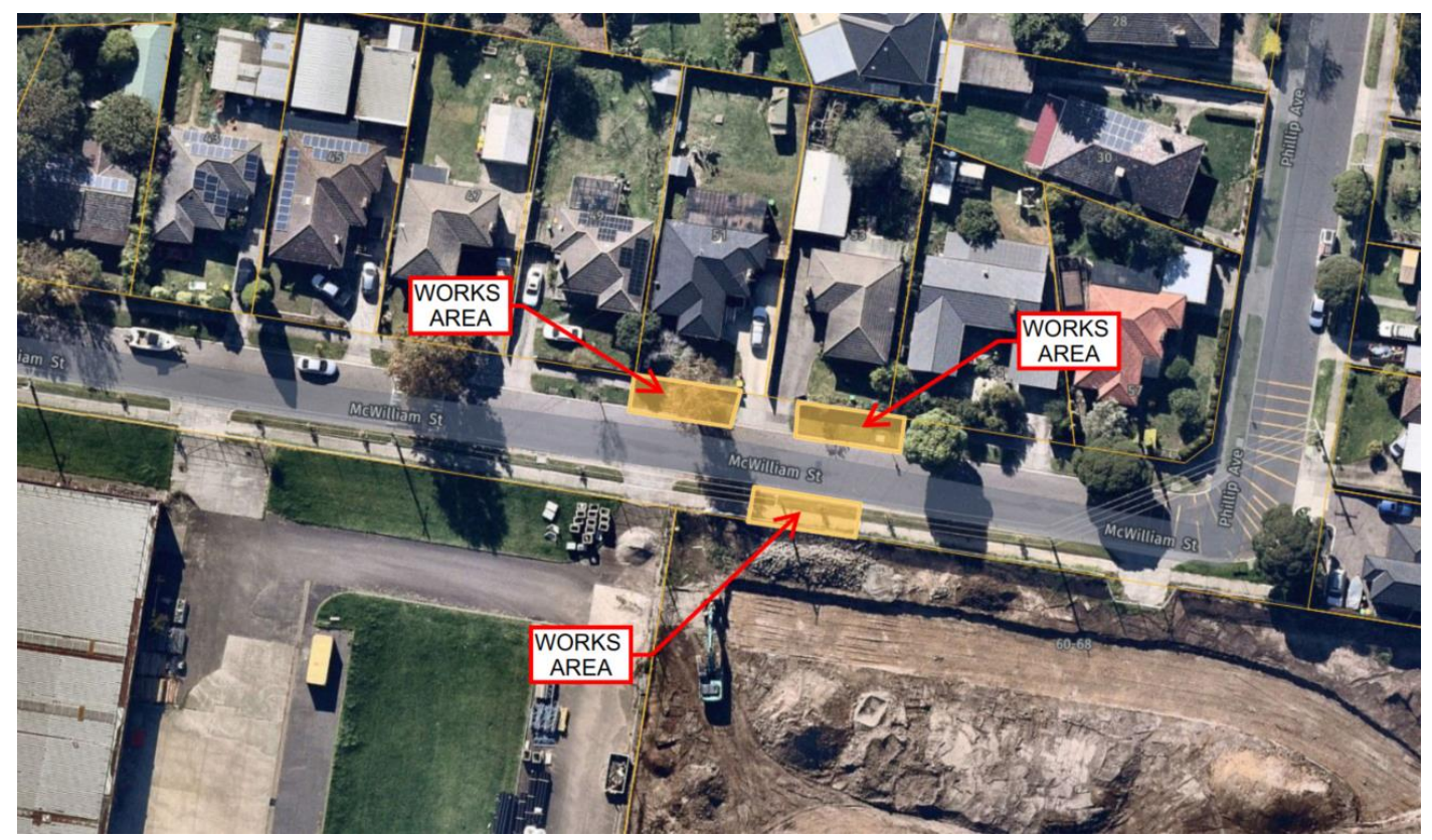
Indicative works areas